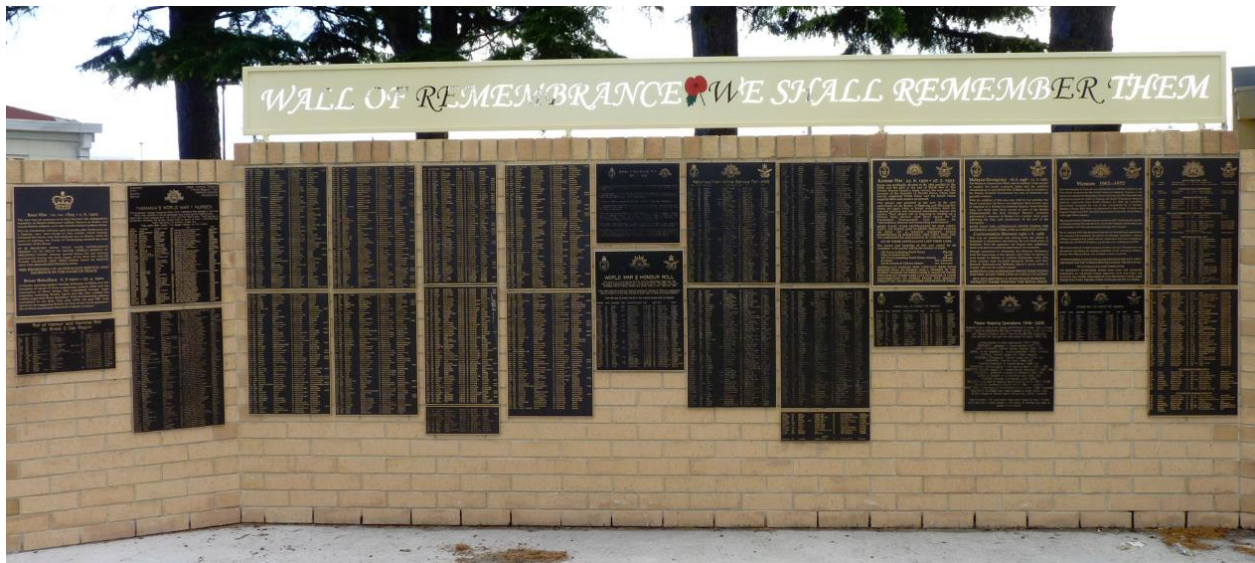
Wall of Remembrance, St. Helens, Tasmania

"What these men did nothing can alter now. The good and the bad, the greatness and the smallness of their story will stand. Whatever of glory it contains nothing now can lessen. It rises, as it will always rise, above the mists of ages, a monument to great hearted men; and for their nation, a possession forever. "