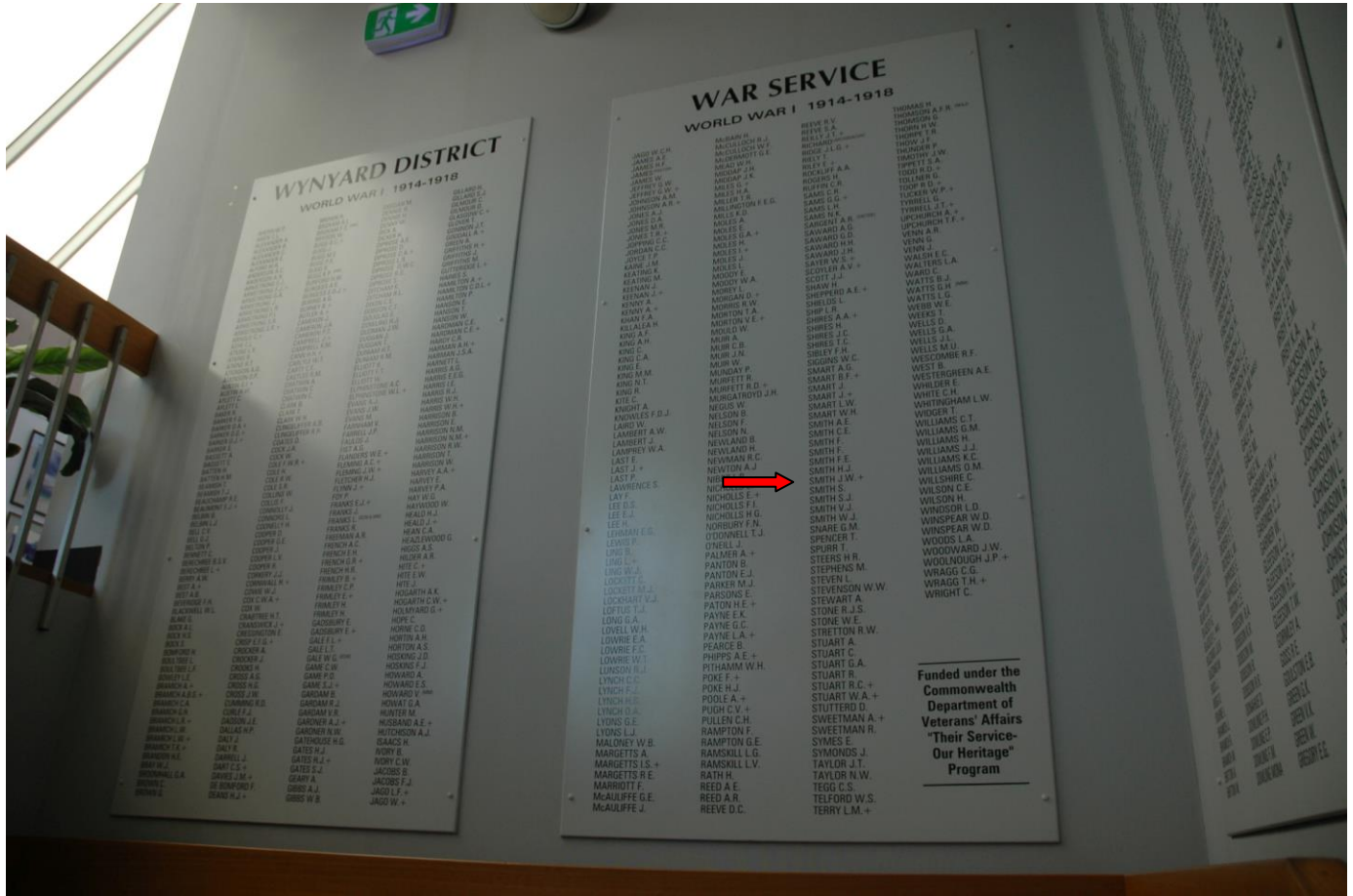
Wynyard District Council Chambers Honour Roll