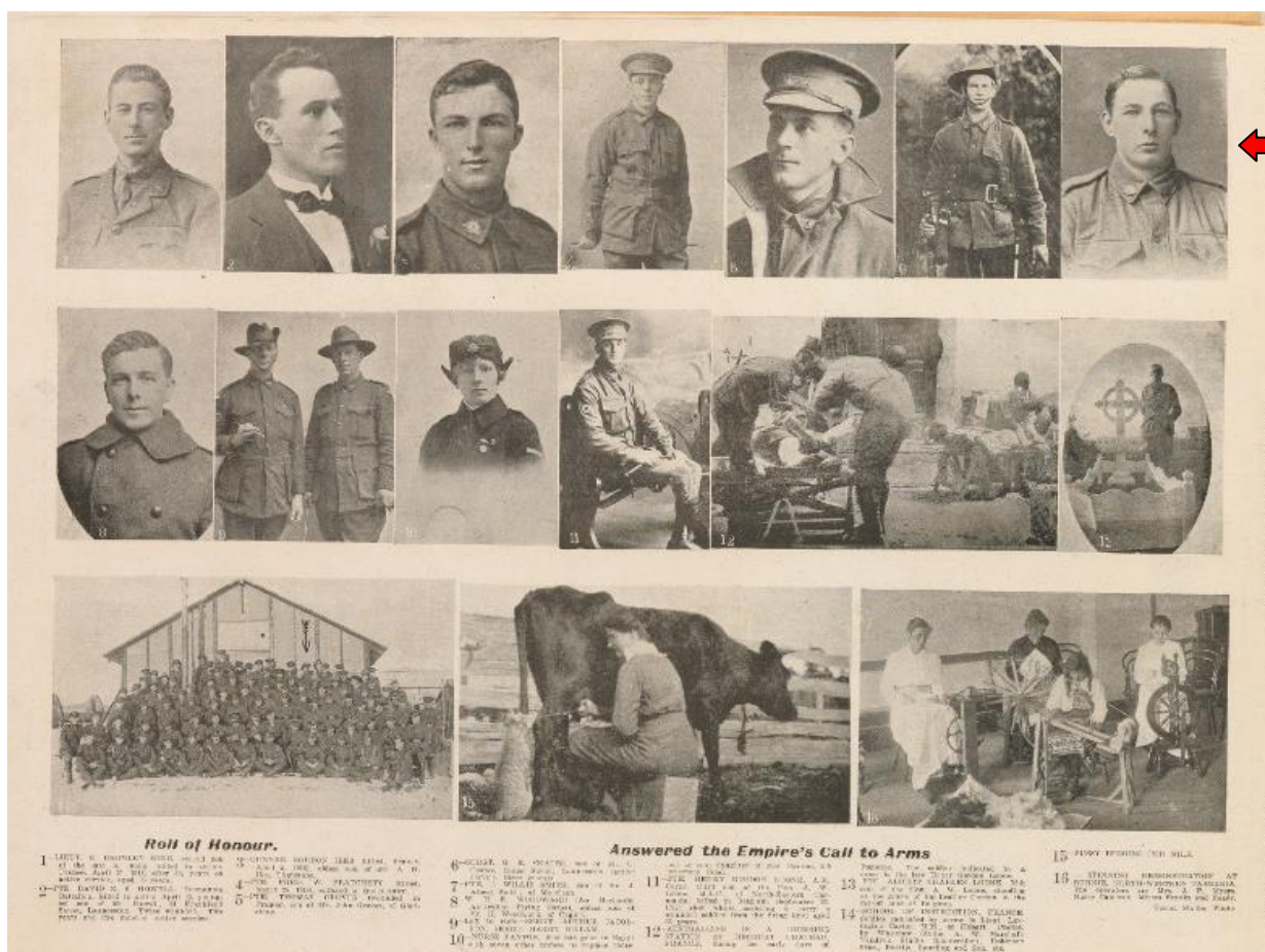
(Weekly Courier, Tasmania – 16 May, 1918)