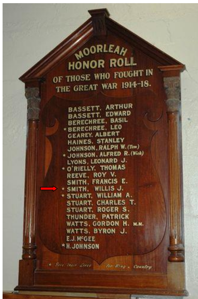
Moorleah Honour Roll